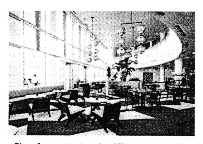
Five Accounts for the Ultimate Interior Design Inspiration Design & Living